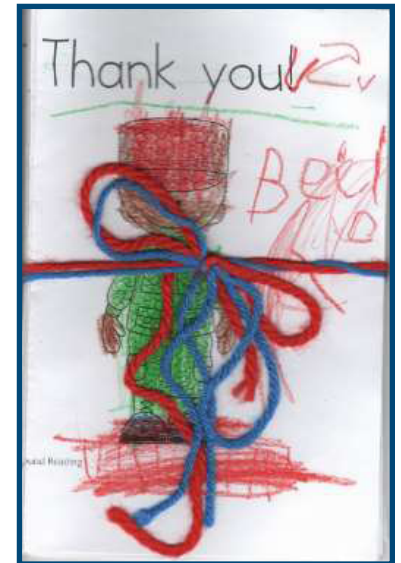
Thank you cards from Clearspring Elementary School.