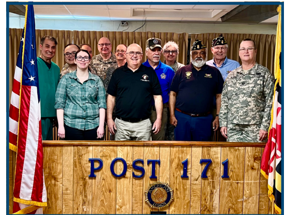
Post 171 President, Health Fair committee, and members of the Maryland Defense Force's 10th Medical Regiment.

We will hold a blood drive July 7 from 10 a.m. - 3:30 p.m. at the Post. We hope to have a good turnout from the community as this is during Celebrate Damascus (July 7-8). Please register with the American Red Cross . You can search for our blood drive in the upper right corner by zip code and pick a time that works for you. The Red Cross is also offering a Red Cross dry bag as a thank you gift for blood donors July 1 - 11, while supplies last.