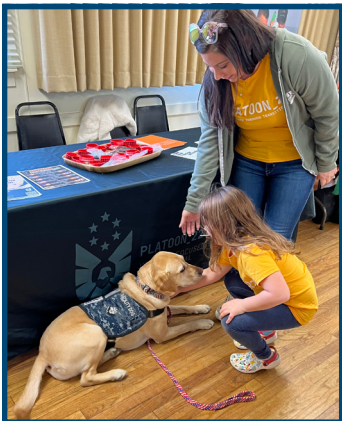
Platoon 22 had one of the most popular volunteers.

Thank you to the Post and Auxiliary Members that contributed to the Health Fair that was held on March 18. We were able to serve veterans and the community by gathering several services and health care professionals in one location. We offered free health screenings, NARCAN training, and access to Veterans Affairs eligibility and enrollment specialists, among many other professionals and organizations that volunteered. We also thank Mission BBQ for generously providing lunch.