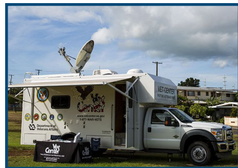
A VA VetCenter vehicle sits at a Veteran's Crisis Command Center setup by The American Legion at the Oahu Veterans Center on Sept. 9, 2014 in Honolulu, Hawaii.